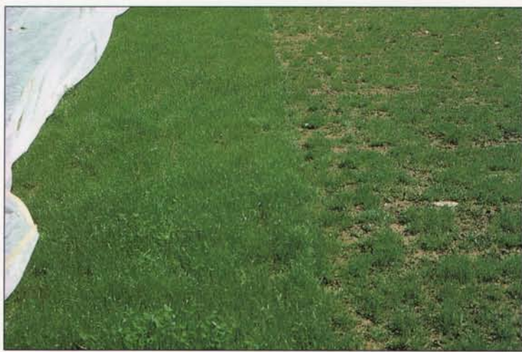
A spring photo of a fall perennial ryegrass seeding compares a control plot (right) to one that was covered during the winter with a geotextile.

One of the key principles in reducing winter damage on sports fields is to provide rapid soil drainage. Poorly drained fields are highly vulnerable to an array of winter injuries. Unless the drainage is improved, it's usually just a