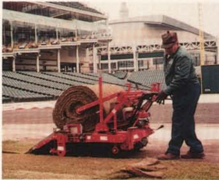
INSTALLED CLEVELAND INDIANS IN 42" AND 48" ROLLS

Cygnnet the little company with the big reputation for quality turf installations.