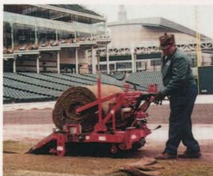
INSTALLED CLEVELAND INDIANS IN 42" AND 48" ROLLS

Cygnnet the little company with the big reputation for quality turf installations.