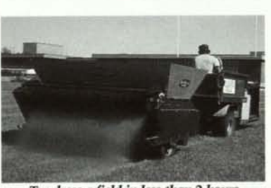
Top dress a field in less than 2 hours