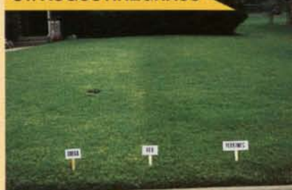
8 oz. rate after 48 hours — Home lawn of turfgrass researcher, Bryan, TX