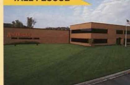
8 oz. rate after 24 hours AMERICAN FIRE SPRINKLER, Mission, KS

*All rates are per 1,000 sq. ft. of turf. Hours indicate time elapsed between treatment and photo. Green-up is usually complete within 24 to 48 hours.