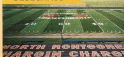
3 oz. rate (alternate 5 yard sections treated). Photograph after 72 hours. MONTGOMERY H.S., Crawfordsville, IN