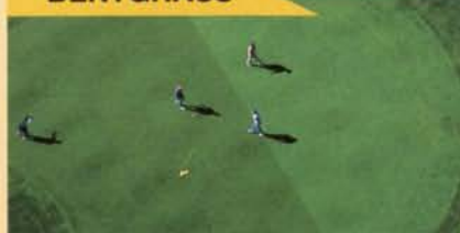
5 oz. rate* after 24 hours HODGE PARK G.C., Kansas City, MO