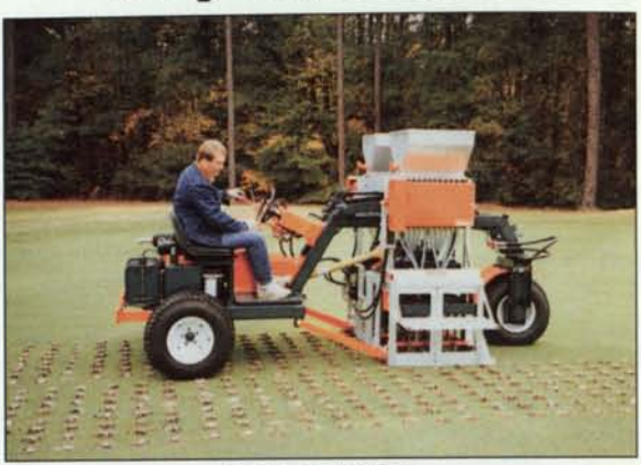
U.S. Pat. No. 4,476,938