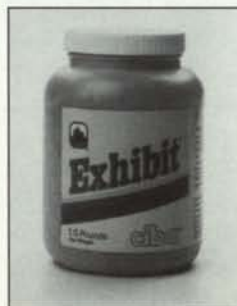
Exhibit contains beneficial nematodes that seek and destroy target insects, and provides effective control against fungus gnats, black vine weevils, strawberry-

root weevils, grubs and shore flies. It also controls cutworms, sod webworms and billbugs in turf. The product provides