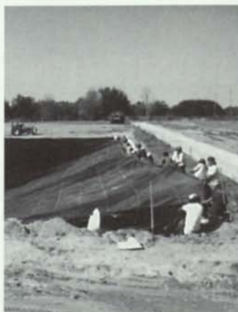
STORMWATER RETENTION POND