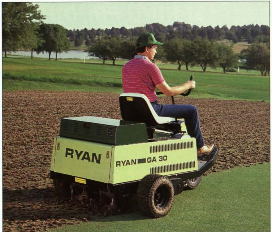
Riding aerator with hollow tines at work.