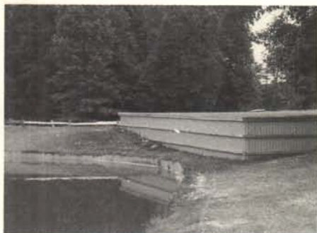
Control erosion in sand traps, water hazards and other fragile areas