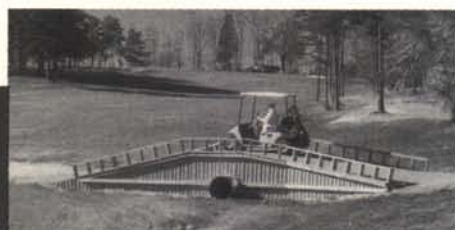
Use C-Loc to create golf cart paths over drainage ditches

Now there's a simple, economical, beautiful way to improve any golf course.