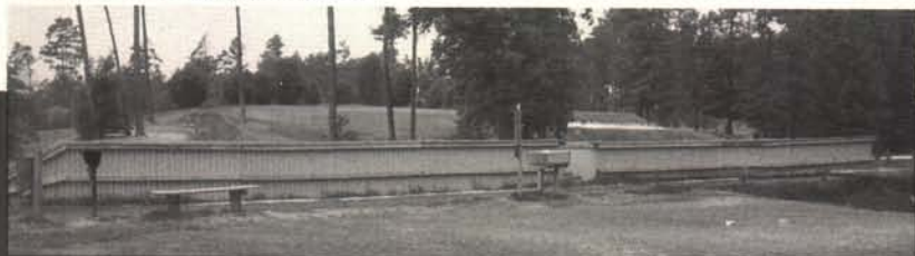
Build up low spots, expand tee areas