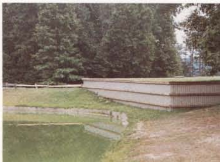
Control erosion in sand traps, water hazards and other fragile areas