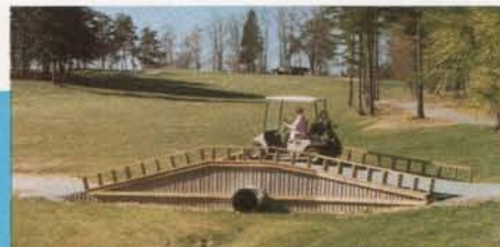
Use C-loc to create golf cart paths over drainage ditches