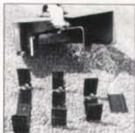
Original Greenstate DonuT Trimmer Edging Blades