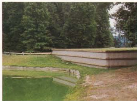
Control erosion in sand traps, water hazards and other fragile areas