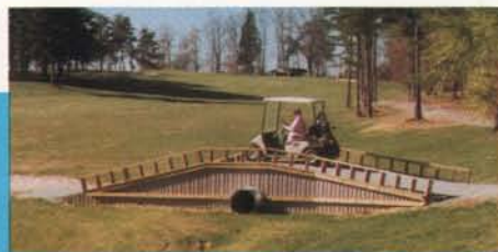
Use C-Loc to create golf cart paths over drainage ditches

Now there's a simple, economical, beautiful way to improve any golf course.