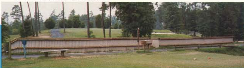
Build up low spots, expand tee areas