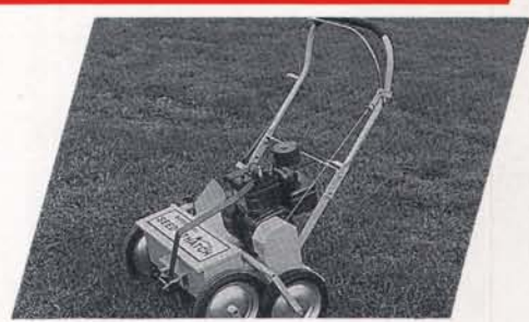
MODEL 85 — 5 hp Seed 'n Thatch, low cost combination thatcher/seeder.

With Olathe Slit Seeders you: • use less seed • get higher germination rates • have a healthier root system • thin out thatch and undesirable species • provide safer turf for sport areas • achieve the most important goal in over-seeding, namely, seed to soil contact.