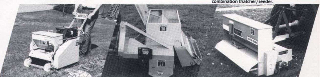
MODEL 84 walk-behind slit seeder, 18 hp, self propelled.