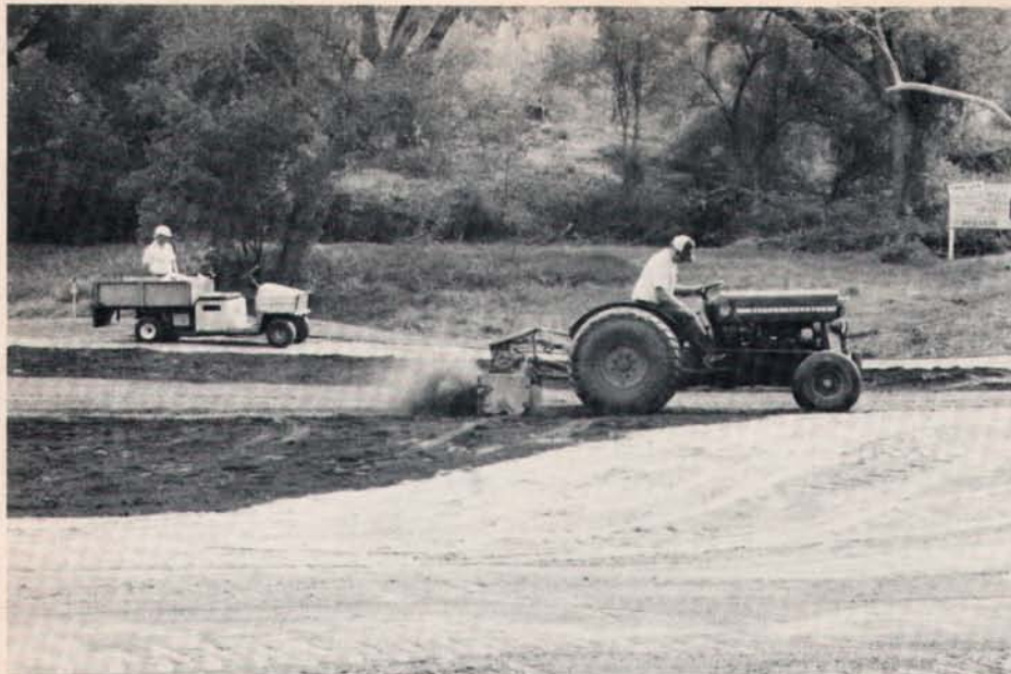
Three greens have been rebuilt with Penncross sod from the resort's nursery.