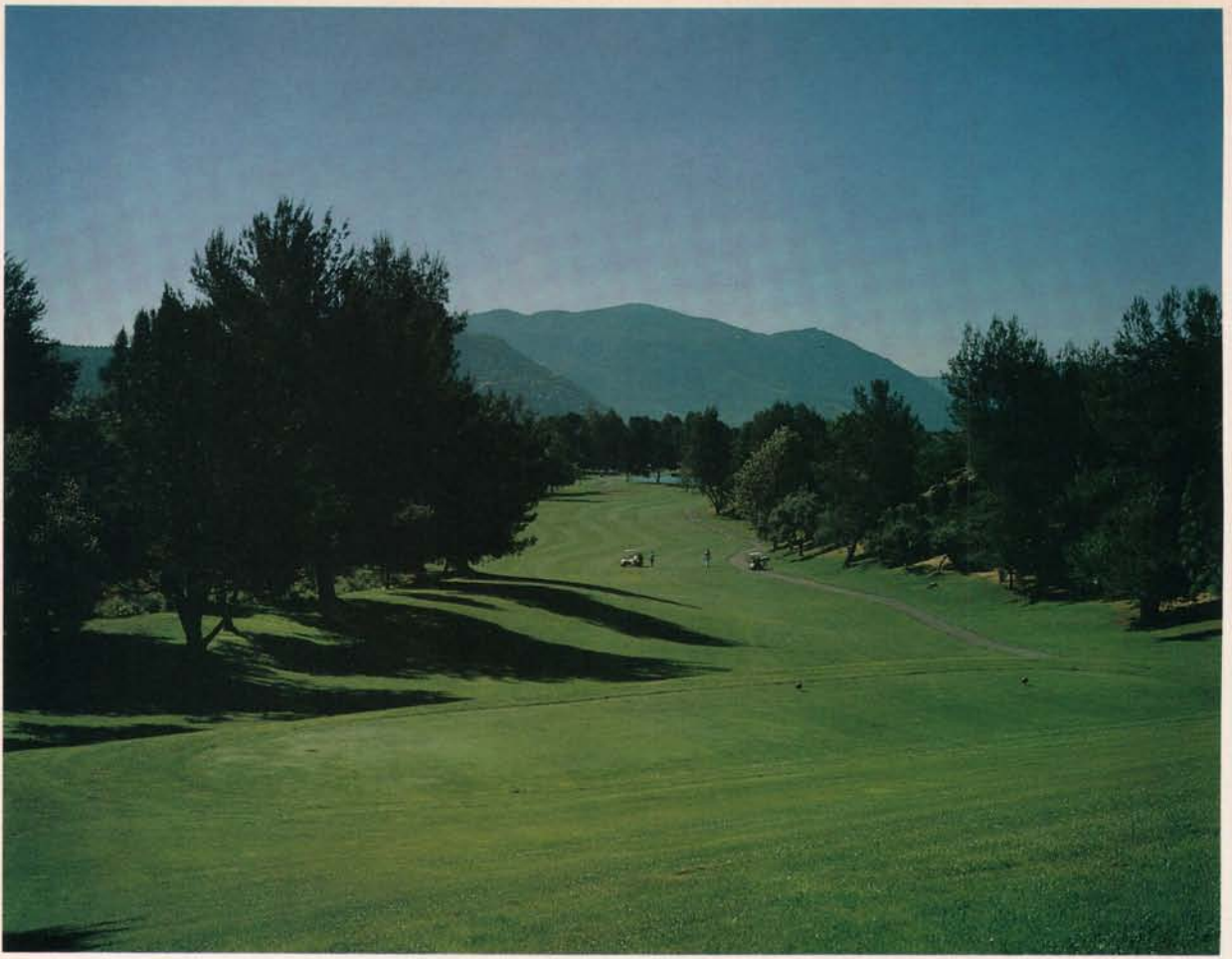
Tight common bermudagrass fairway at Pala Mesa Resort.