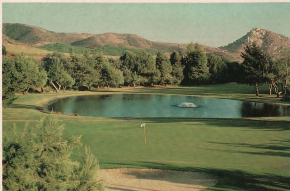
Water and trees make the approach to this large undulating green challenging.