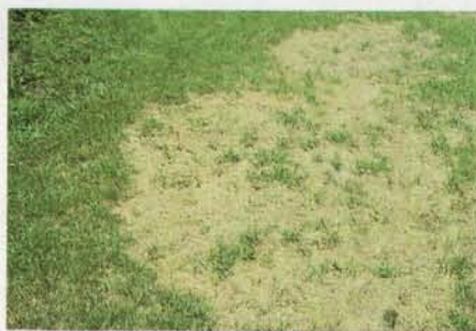
Rhizoctonia Brown Patch.