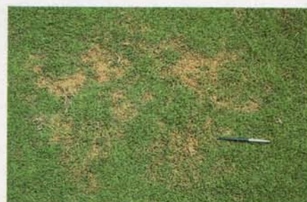
Pythium Blight on bentgrass.