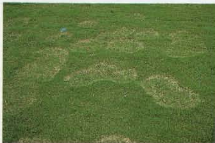
Necrotic Ring Spot on Kentucky bluegrass.

Sports facility managers and architects complicate matters further when bentgrass greens are planted in the humid Southeast, athletic fields and golf courses are overseeded with cool-season grasses in the Sun Belt, and use levels of sports turf in the North increase disease pressure on bentgrasses,