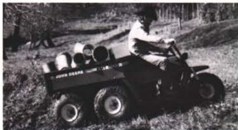
The AMT 600 from John Deere carries

up to 600 pounds of cargo over all kinds of terrain. A variable-speed drive system eliminates the need for shifting and helps match traction to the terrain. A differential action allows the inside wheels to rotate slower than the outside wheels in a turn, lessening wheel skid and tire scuffing.