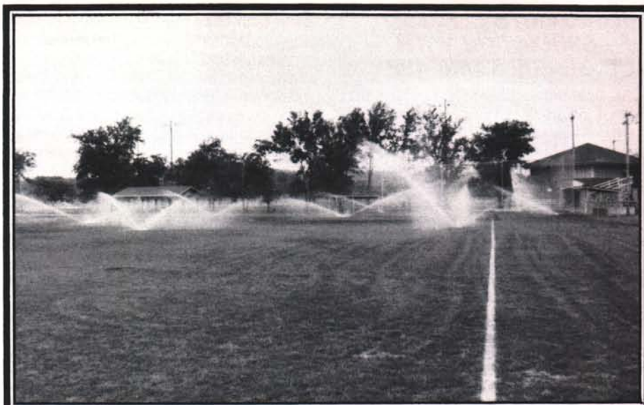
The irrigation system installed at this Little League field convinced Huntsville residents and the city council that a new irrigation system was needed for all park fields.

Outside of sports turf, Schumacher is also responsible for the landscape and medians in the city's new 1,200-acre Research Park. More than 70 acres of grass medians wind through the industrial park which contains