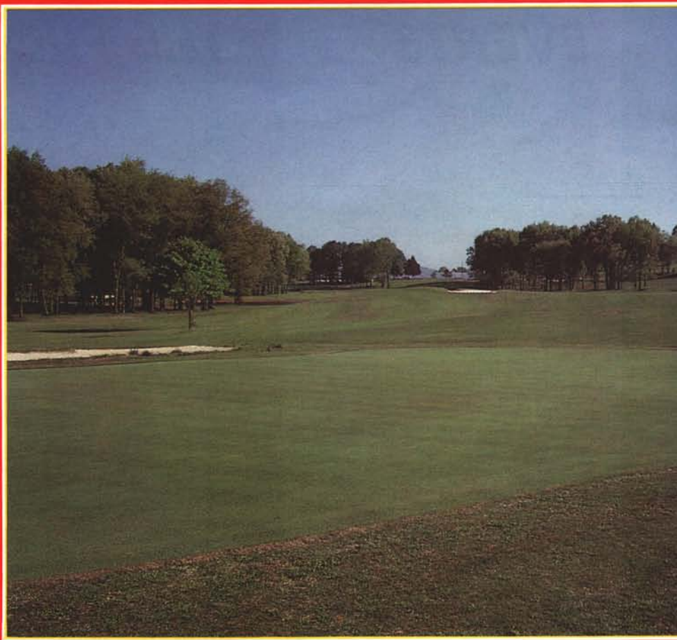
Huntsville Municipal Golf Course was totally redesigned and reconstructed. Lakes, sand traps, bentgrass, and other improvements turned a poor course into hopefully one of the best in the nation.