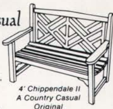
4' Chippendale II A Country Casual Original

Country Casual is a DIRECT IMPORTER of Lister, Charles Verey, and private label original designs MADE IN ENGLAND.